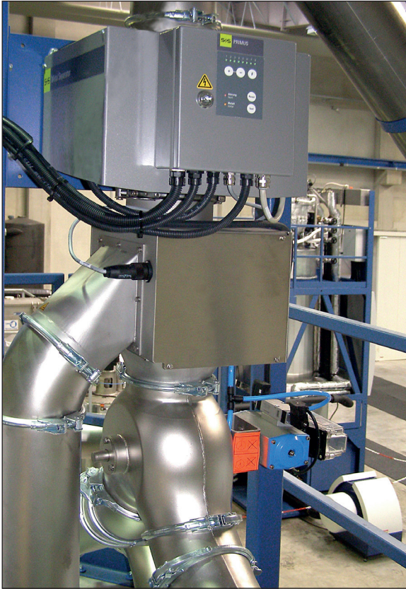
Installation example: Metal separator RAPID VARIO-FS used for the quality control of PET regenerate. (old version)