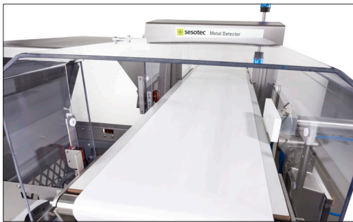
VARICON+D metal detection system with INTUITY detection coil and Higher Level Security option.