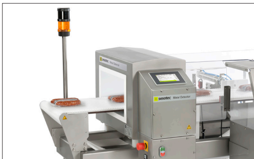
VARICON+W with GLS and with linked belt for the inspection of packed piece goods in wet areas.