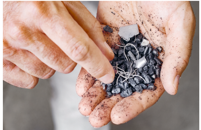
The RE-SORT metal separation unit for post-cleaning of heavily contaminated material

Integrated version: The RE-SORT metal separation unit can also be used within the central material handling system, where it acts as a metal pre-cleaning station.